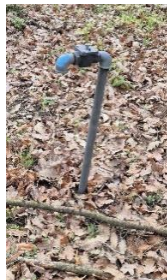
different water taps