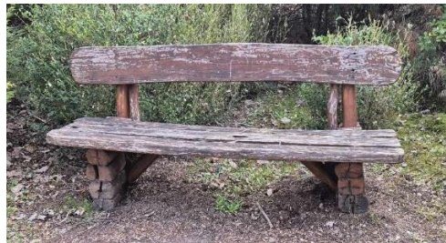
fixed alone bench